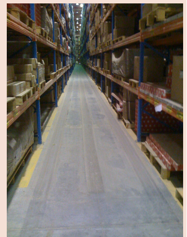
Narrow Aisle at Alghanim DC

Each new aisle way was then surveyed by Face Consultants, to identify the areas that were not compliant with the desired DM2 specification. This meant that only the non-compliant sections of aisle way were to be ground using the Laser Grinder®, which in turn,